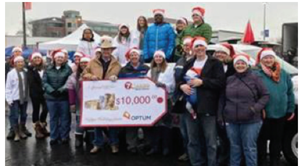
7Cares Idaho Shares day in Boise, Idaho